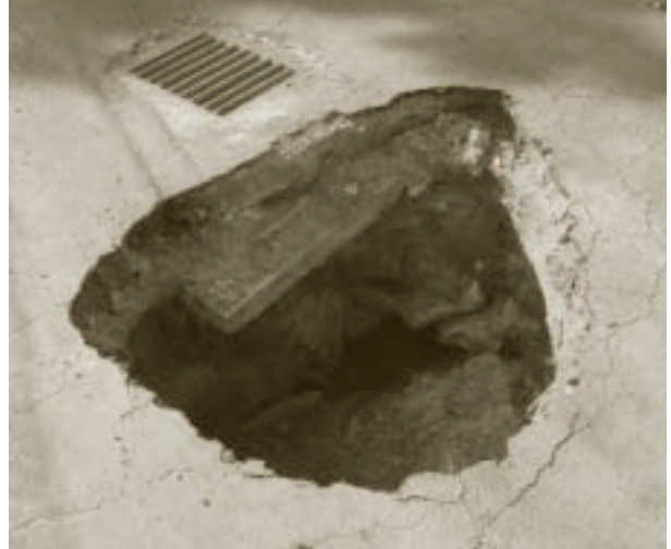
Congratulations to Jennifer Wood who took this picture near the Mill Village area in Greenville County, South Carolina.

The old-fashioned method of using bricks and mortar to join pipes into structures in storm sewer construction gives everybody problems, from the contractor to the customer. Now you can turn one of these cracked messes into enough money for a good dinner for two, just for sharing your photos with "Good Connections". Each issue will feature photos of real-world problems caused by rigid brick and mortar joints. If your photo is selected, we'll send you a check for $100, your reward for helping us educate others about using flexible connectors in storm sewers. Please e-mail your pictures to mailroom@frankgroupinc.com or mail to Frank Group, Inc., 2555 Kingston Road, Suite 230, York, PA 17402. Please be sure to reference the Watertight Storm Sewer Group.