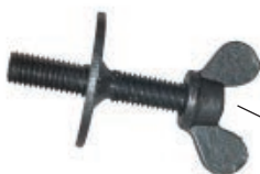
LH-1099-U-S (Installation Pin T-Bolt)