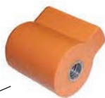
LH-1099-U-P (Urethane Lift Pin Holder Insert)