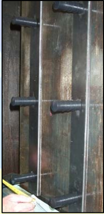
3' Set Mounted to Form

Call A-LOK Products at 800-822-2565 for ordering or information E-mail orders to sales@a-lok.com