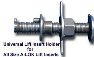
Universal Lift Insert Holder for All Size A-LOK Lift Inserts