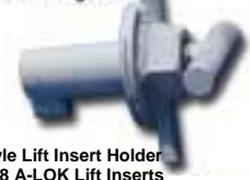
Coil Style Lift Insert Holder For 1098 A-LOK Lift Inserts