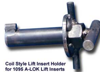
Coil Style Lift Insert Holder for 1095 A-LOK Lift Inserts