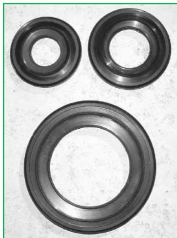
X-CEL™ 9091 CONNECTOR