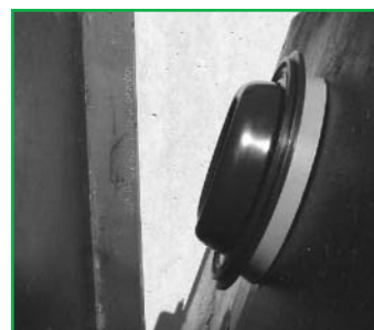
CONNECTOR ROLLED BACK ON MANDREL ATTACHED TO FORM