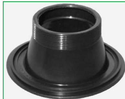
Z-LOK® C104-4 CONNECTOR

CAST IN CONNECTOR CLAMPED DOWN ON PIPE TO CREATE WATERTIGHT CONNECTION